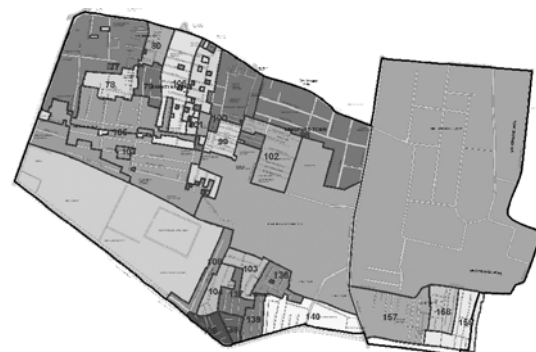
Before cleansing picture shows splintered polling booth areas in Shanthinagar ward

CIVIC Executive Trustee made a presentation of this successful intervention at the 4 th National Meeting of the Association for Democratic Reforms in Mumbai on 31 st January 09 at which all the three Central Election Commissioners were present.