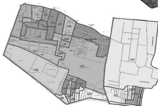
After cleansing picture shows contiguous polling booth areas in Shanthi nagar ward

CIVIC, along with SHRED, facilitated the dissemination of information on candidates and the holding of a “Meet the Candidates” programme for Bangalore Central Lok Sabha Constituency on 19 th April 2009.