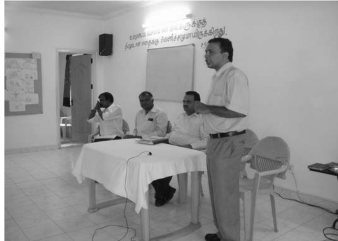
Meeting with KSCB officials regarding implementation of JnNURM project in Deshyanagar – 3 rd June 200p.

implemented for them. Even the implementation process is happening without people's participation.