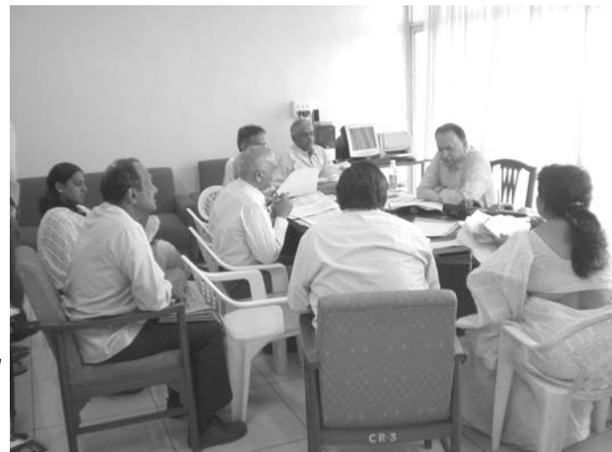
KRIA Katte activists meet Secretary, DPAR, Janaspandana Cell

In this meeting of the Karnataka Right to Information Activists' Forum (KRIA Katte) with the Secretary of the Department of Personnel and Administrative Reforms,